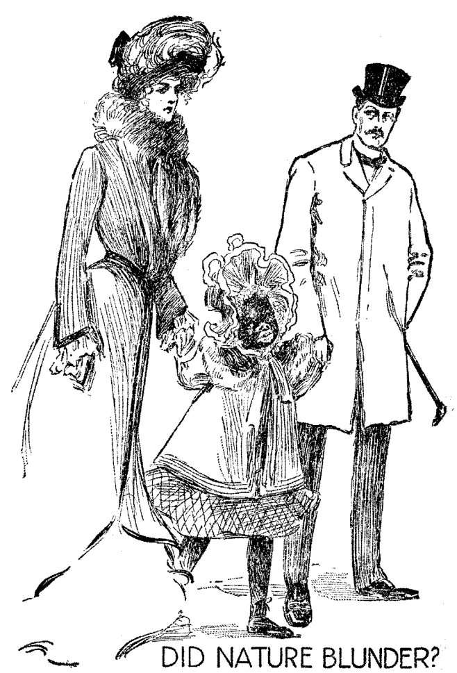
Would you believe that the above negro was the daughter of pure whites? Never, though it was written in letters of fire upon the face of the heavens.