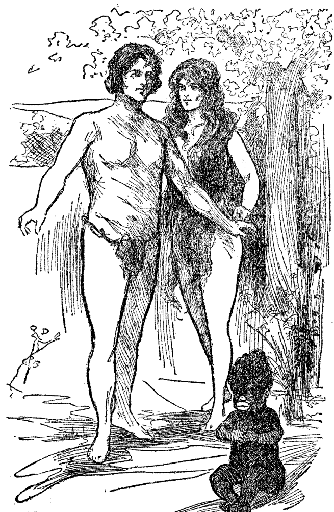
ADAM and EVE in the GARDEN of EDEN. Is the negro an offspring of Adam and Eve? Can the rose produce a thistle?