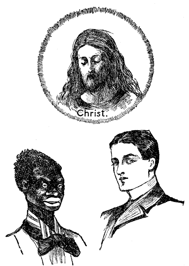
CHRIST-THE SON OF GOD. Man was created in the image of God. Is the negro in the image of God's son-Christ?