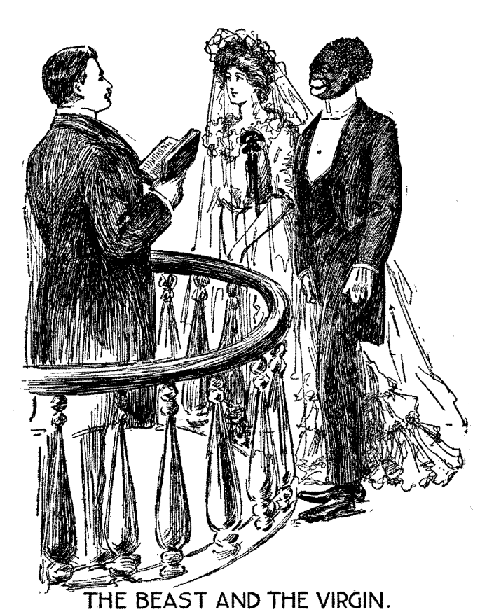
Can you find a white preacher who would unite in holy wedlock, a burly negro to a white lady? Ah! parents, you would rather see your daughter burned, and her ashes scattered to the winds of heaven.