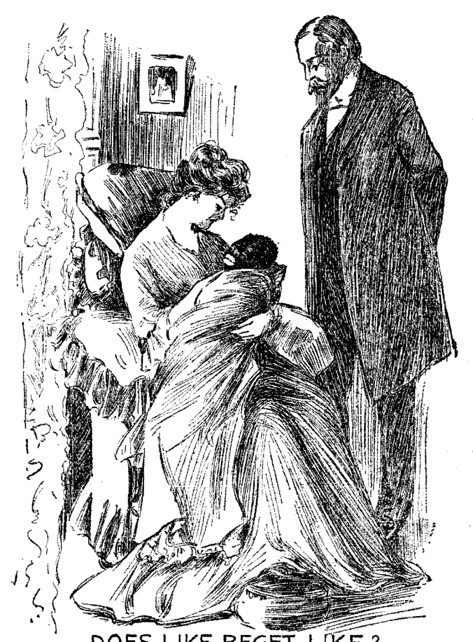
DOES LIKE BEGET LIKE? Could that negro child be the child of pure Adamic parents? If the negro is an offspring of Adam and Eve, then it is possible.