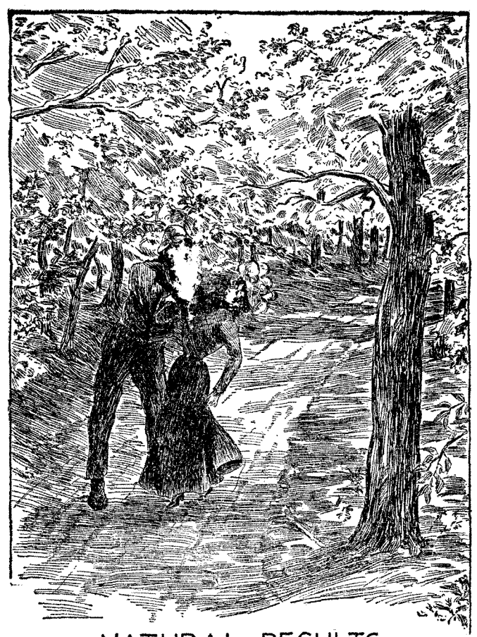
NATURAL RESULTS. The screams of the ravished daughters of the "Sunny South" have placed the Negro in the lowest rank of the Beast Kingdom.