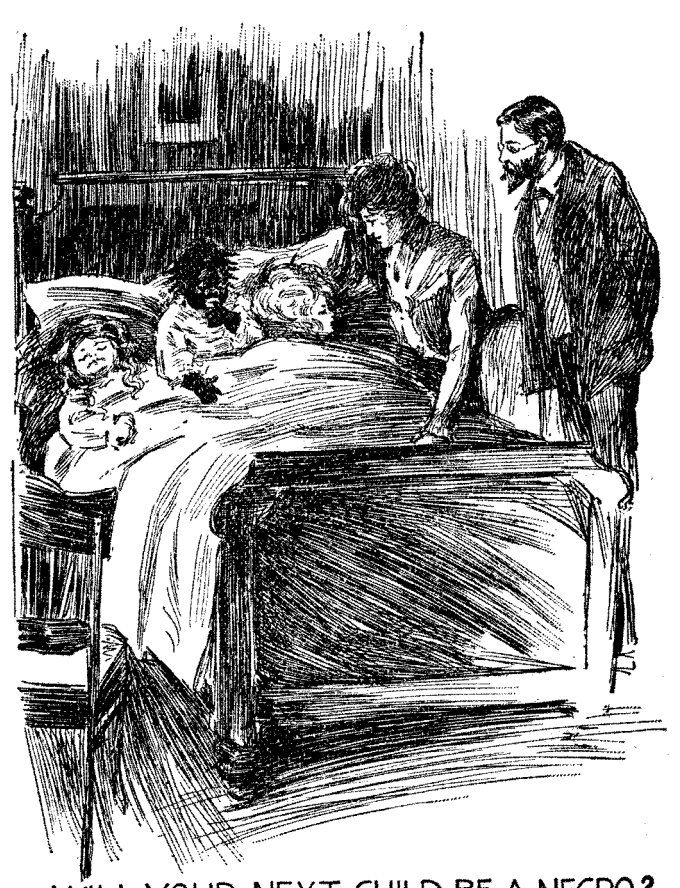
WILL YOUR NEXT CHILD BE A NEGRO? Your children are "bone of your bone" and "flesh of your flesh" then who can believe that the negro is an offspring of Adam and Eve, without fearing that their next child may be a negro.