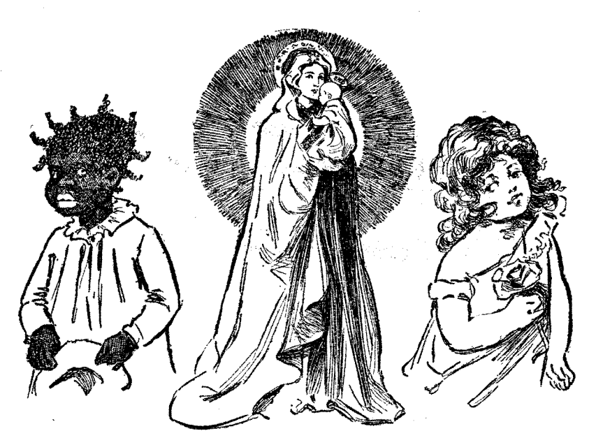
The VIRGIN MARY and the CHILD CHRIST. Could the Child Christ possibly be of the same flesh as the Negro?